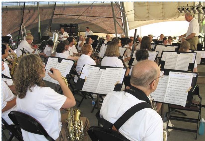
On stage in Charlottesville, July 2

The Fourth of July concert was rained out—make that “torrent-ed out” as intense storms broke over Blacksburg after the parade. Band members who had made it out to Caboose Park met in a shelter and had some good food and fellowship—if a bit soggy!